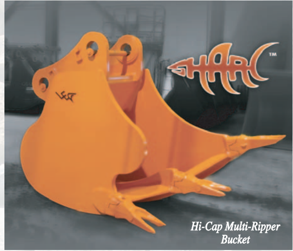
Hi-Cap Multi-Ripper Bucket